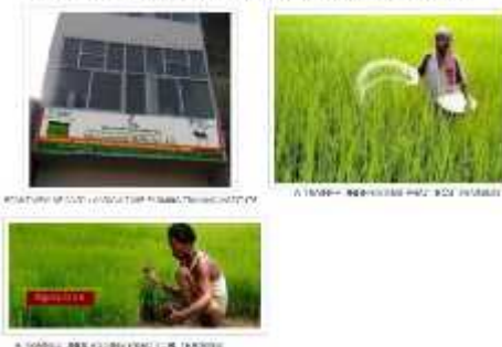
PHOTOS OF AGRICULTURE FARMING TRAINING AREA

classroom and apparel fabrication centre to impart hands on practical training & practice by very experienced, qualified & mature faculty.