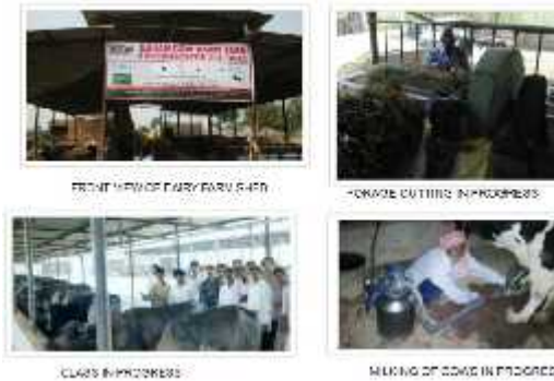
PHOTOS OF DAIRY FARMING TRAINING AREA

It is located on NH-1 near Sonipat on Delhi- Ambala National Highway. It boasts of a well equipped & very well maintained dairy farm, an excellent classroom with all modern facilities in spite of being in rural area. It has excellent faculty with good communication skills in